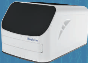
Singleron Matrix NEO